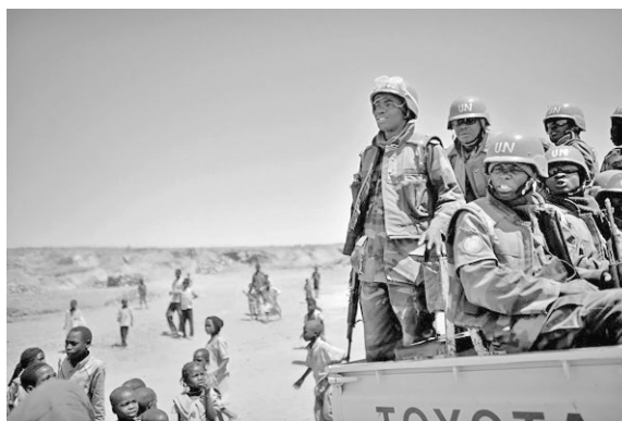
Nigerian soldiers riding through Genina with the hybrid peacekeeping force in Darfur sponsored by the United Nations and the African Union.

“The rise in consciousness, in spite of the many political conflicts among nations, is a very exciting and welcome development. From an ethical standpoint, whatever we can do to contribute to this consciousness is a keystone of our effort.”